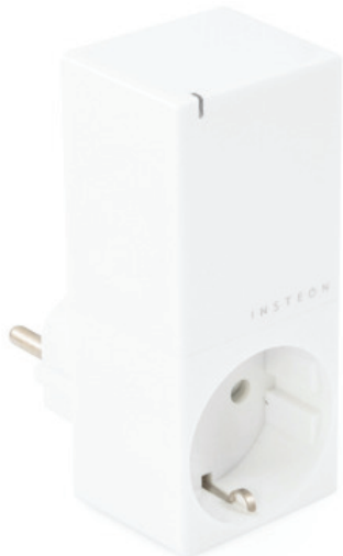
2633-432 (Germany) 2633-452 (Chile)